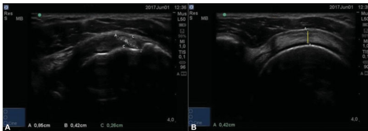
Fig. 2 A -Measurement of the width of the LHB (a: maximum diameter of the LHB; b: midpoint of the diameter of the LHB; c: width of the LHB). B -Measurement of the width of the supraspinatus tendon. Abbreviaton: LHB, tendon of the long head of biceps.

IBM SPSS Statistics for Windows, Version 24.0 (IBM Corp., Armonk, NY, USA) was used. A descriptive analysis of the sample was performed displaying the mean ± standard deviation (SD) for the quantitative variables and the percentage for the qualitative variables. The intraobserver reliability was determined using the ICCs. The study of the independence of qualitative variables was performed using the chi-squared test or, in its defect, the Fisher exact test, according